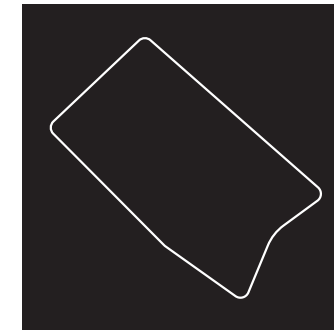
📍 Cal Bartomeu 41°30'19.3"N 1°47'08.2"E

The Macabeu comes from two plots on the same estate, surrounded by forest. Sota l'Hotel has very low yields (approx. 4,500 kg/ha) and soils with a strong presence of clay and some sandier parts. Sota Vía is a plot with vines around 34 years old on shallow, calcareous soils with a clay-loam texture.